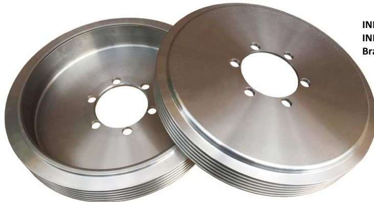
INR503 Rear Brake Drums (Pair) (Ace) Billet Aluminium with Liner