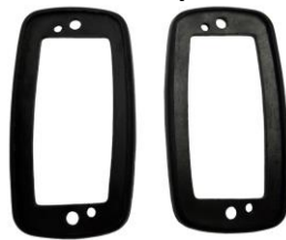
INR1030 L542 Rear Light Rubbers (Pair) (AC Ace)