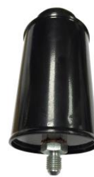
INR1160 Brake Reservoir (Large single outlet)