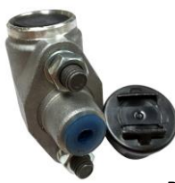
INR1188 2 Stud Wheel Cylinder (Cooper Bristol)