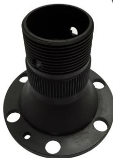
INR1152 Rear Wheel Hub (AC Ace)