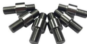
INR1152S Rear Wheel Hub Pin Set Flange to hub (AC Ace)