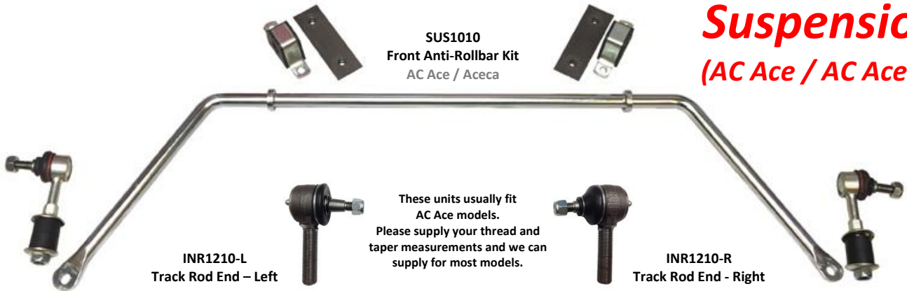
SUS1010 Front Anti-Rollbar Kit AC Ace / Aceca

These units usually fit AC Ace models. Please supply your thread and taper measurements and we can supply for most models.