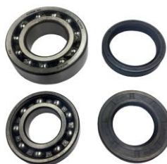
INR1153 Rear Wheel Bearing Kit (Per Corner) (AC Ace)