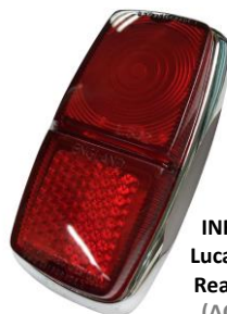
INR1029 Lucas L542 Rear Light (AC Ace)

Uprights and wishbones are mating pairs and are often worn, so we would need preferably the actual units themselves and recondition them in our workshop, or we can produce parts to sample or with dimensions. Wishbones and wishbone components such as pins and bushes are usually made to order.