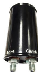
INR1161 Brake Reservoir (Large, double outlet)