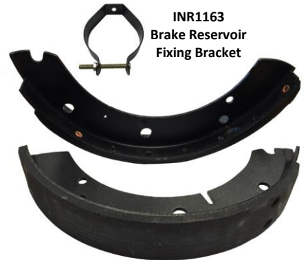
INR1163 Brake Reservoir Fixing Bracket