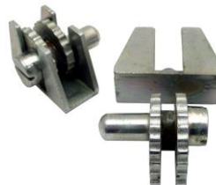
INR500S Small (Pair) INR500L Large (Pair) Brake Adjuster Snail including guide