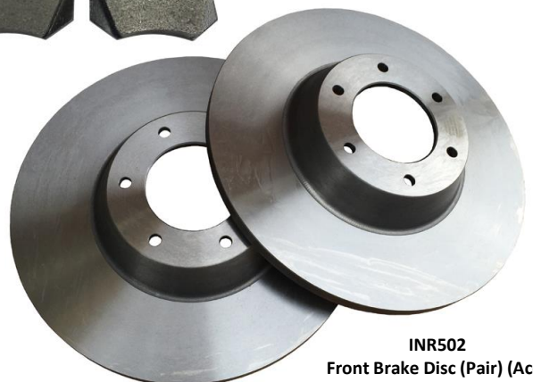
INR502 Front Brake Disc (Pair) (Ace)

INR510-L Aluminium (Left Hand) INR510-R Aluminium (Right Hand) INR511-L Magnesium (Left Hand) INR511-R Magnesium (Right Hand)