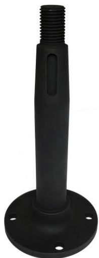
INR1211 Rear Outer Drive Shaft (AC Ace / Aceca)