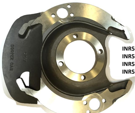
Cooper Bristol Front Brake Plate

We would need specific details for your application. The turn around time is usually 5-8 working days.