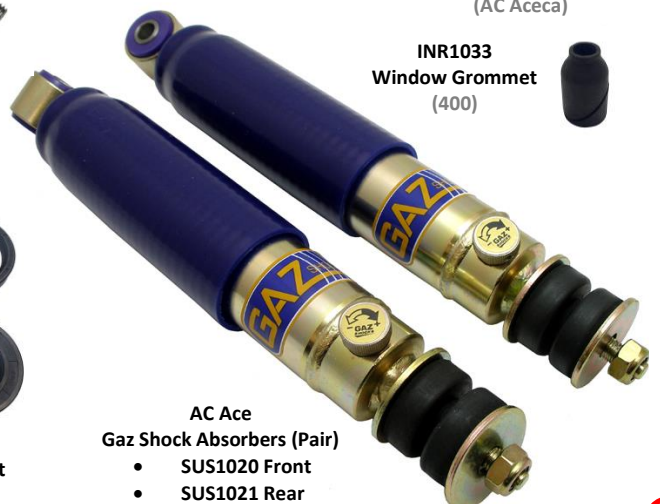
AC Ace Gaz Shock Absorbers (Pair) • SUS1020 Front • SUS1021 Rear

Rear wheel hubs and inner shafts are produced in house and are supplied as a mating pair. They are supplied with sided threads.