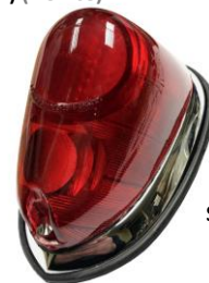
INR1028 Lucas L549 Rear Light (AC Ace / Aceca)

Replacement speedo and accelerator cables are supplied to order. Made using a pattern or a supplied length. Please contact for further details.