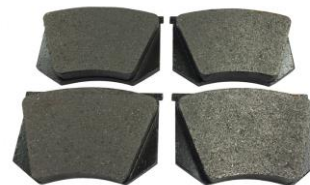
GBP101 Front Brake Pad Set (Ace)

INR1164 We can re-condition your original brake shoes to size. These are usually re-lined at 4mm, 6mm or 8mm thick, and are supplied bonded or riveted.