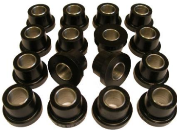
INR1213 Wishbone Bushes & Sleeves (4) (Sold per wheel - whole car set shown here) AC Ace, Aceca Designed for fitment with standard wishbones.