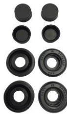
INR501 Wheel Cylinder Repair Kit