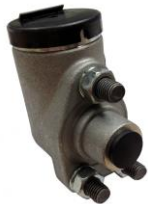
INR1216 3 Stud Wheel Cylinder (Cooper Bristol)

Can also be machined with alternative pcd's for other model cars.