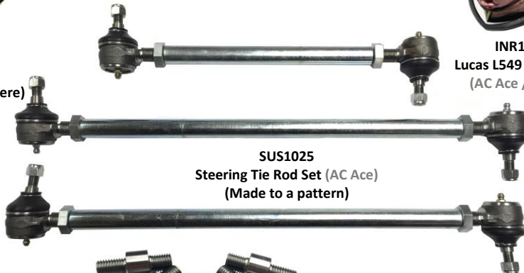
SUS1025 Steering Tie Rod Set (AC Ace) (Made to a pattern)