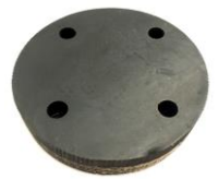
SUS1011 Steering Coupling (Bristol)